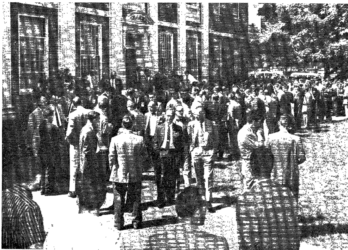
Intermission in front of Paine Hall.